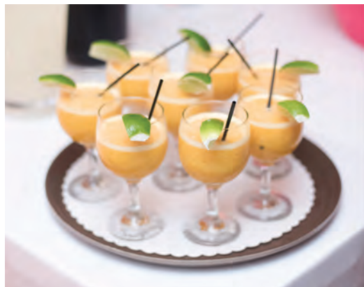
Sweet 16 & Quinceañera Photography