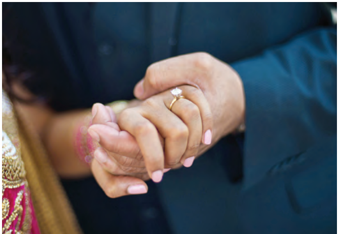
Proposal Photography & Video