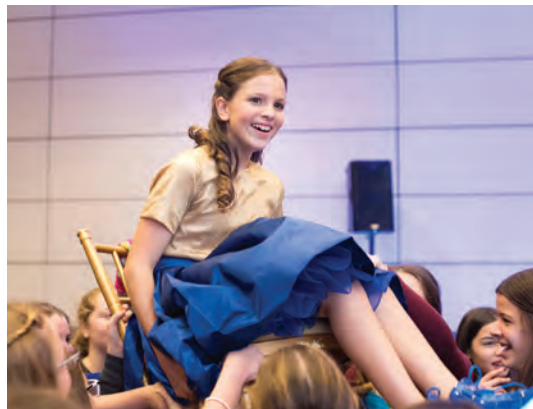
Bar Mitzvah & Sweet 16 Photography